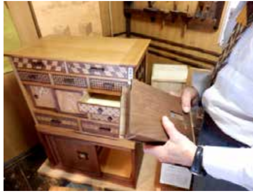
←The brown base cabinet was sized perfectly to store phonographic records because the customer was an avid record collector.