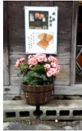
← Left: The view 「KIRAKU」 from the opposite side. The left part is the studio, and the right side is the house.