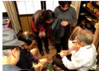
Many visitors in the exhibition room.