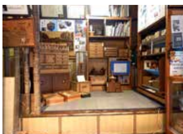
↑ In the exhibition room.