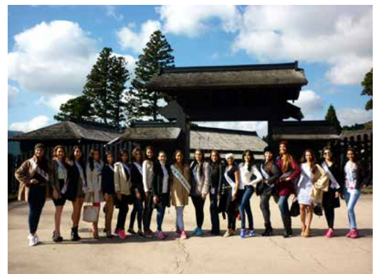
Taking photographs in front of Hakone Check Point.