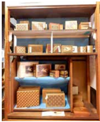
↑ Secret Box corner