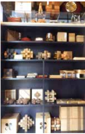
↑ KUMIKI(Burr) corner