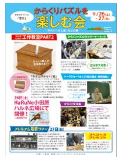
Information of the 5th annual KPH

We will report about KPH5 in the next Karakuri News!