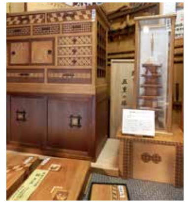
↑ Karakuri chest, Five-story pagoda, letter boxes, etc.