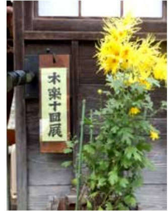
↗ Entrance: There were beautiful yellow asters. It was very suitable with the building.

Ninomiya's solo exhibition was held at his shop "KIRAKU" in Hakone, Yumoto in the deep autumn of November. It is along the historical Tokai-Do street. A short brown curtain hung at the entrance of the shop. It looked very beautiful and charming, when I saw the entrance from the street.