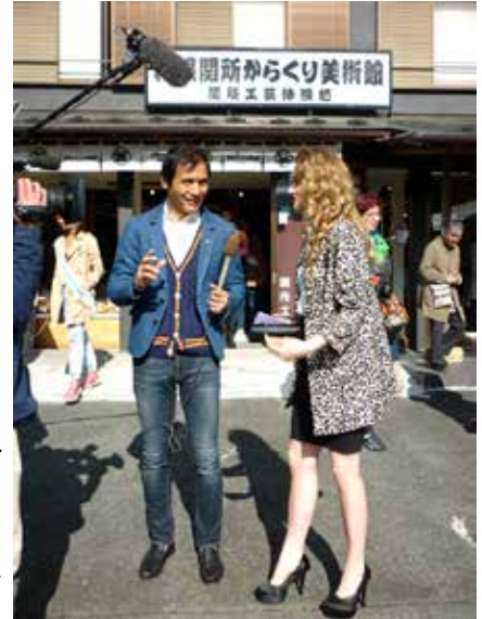
They got interviewed by a TV program.→