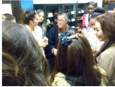
↑ Play corner at Hakone Karakuri Museum. Everyone had fun!