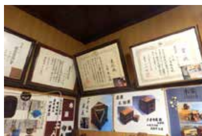
↑ These are the certificates and the posters for his exhibition.