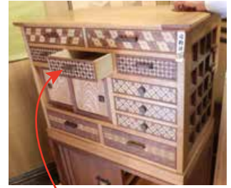
Here is the 'locked' drawer.