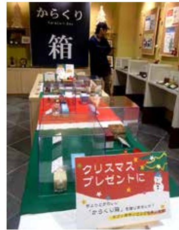
Exhibition at Dec. 2015 ↑ "Karakuri Boxes and X' smas"

We will hold many exhibitions and events at TAKUMI-KAN.