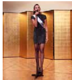
←They were dressed up for the welcome party. All the women were very beautiful!