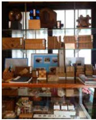
↑ Karakuri Box corner