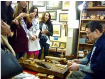
The director of Karakuri Museum demonstrated the thinning of Yosegi, and took a photograph.