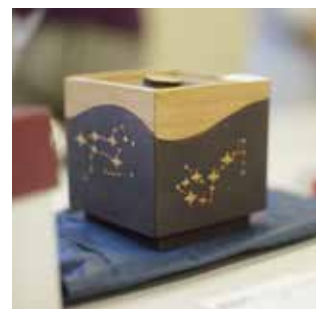
↑ This was handmade by a participant. It's beautiful.