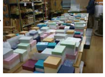
\uparrow Everyone was all smiles at first, but then it became hectic like this \uparrow !