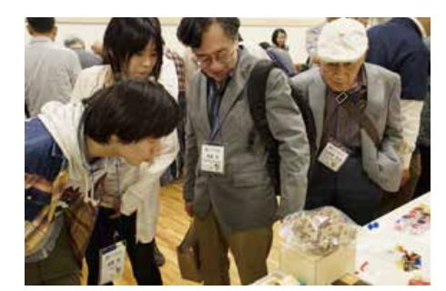
↑ Oh, it's interesting!

Everyone was looking forward to buying their favorite product. There were many shops, not only Karakuri, but also various puzzle or toy shops. At this sale there were some valuable works, so we had a lottery to choose the winners randomly for them. Could you buy your favorite one?