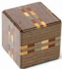
New secret box II

By popular demand, we held the handicraft class for adults, this year as well. The environment of this class was rich. And you could listen to people tell about the history of the traditional Secret box of Hakone.