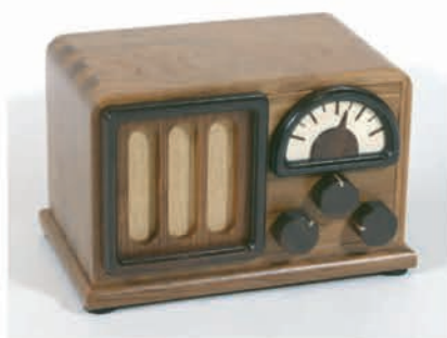
Bad Radio (1987)