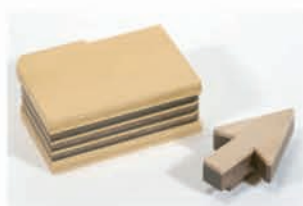
『The folder』 Desinged by Seiji Masuike