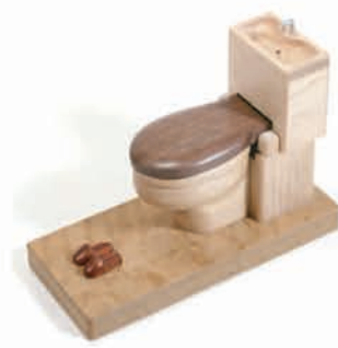
『Toilet』 Desinged by Kyoko Sueda