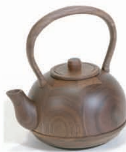
『Teapot』 Desinged by Yoko Miyamoto