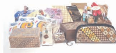
the deluxe prizes !

To get the deluxe prizes, participants needed to solve Karakuri puzzles to find the hidden letter located inside the box. We think everyone enjoyed this kind of challenge. Please join us in next years “Stamp Rally”!