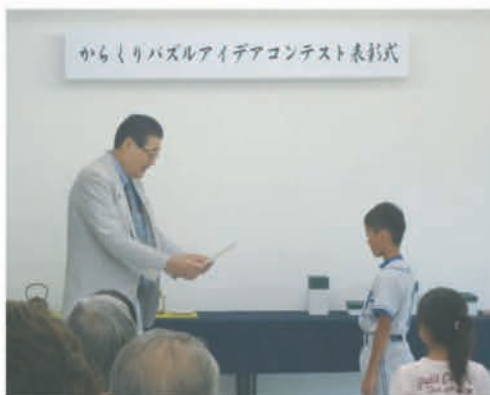
He is the most yungest winner and baseball player!

Many people including the mayor of Hakone, guests, prize winners and our cooperative group members, took part in the ceremony. Thank you so much. And congratulations to the prize winners!