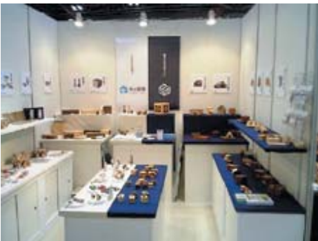
Karakuri booth (Right side). The left side is the booth for Kinokuniya (Wood craft shop).