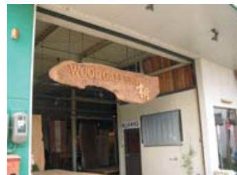
Kamei went to Gifu Prefecture to buy horse chestnut which is the main material in "Phoenix".